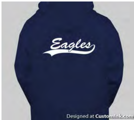
Q of A - "Eagles Hoody" $ 35.00 - Jerzees Zip Front Hoody - Navy