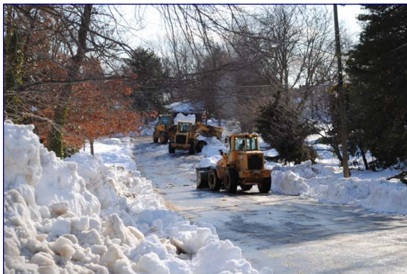
Digging Out