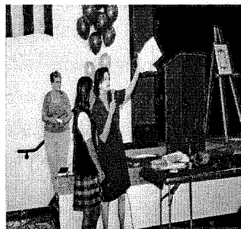
The contents of the Time Capsule revealed

which included old newspapers, literary magazines, award-winning school projects, a video, a cassette recording of the school song, "On Eagles Wings," and more! New items from the current student body and alumni were added to the time capsule before it was reburied.