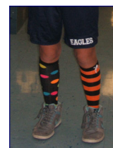
Silly socks and hats

Spotlight is also on the equally awesome coaches for the gift of their time and talent.