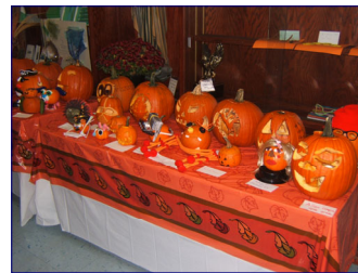
Pumpkin Decorating Contest