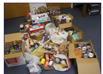
Soup for the needy