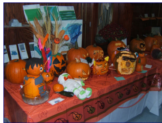
Pumpkin Decorating Contest

Next month: More on what's happening in the classrooms and around the school