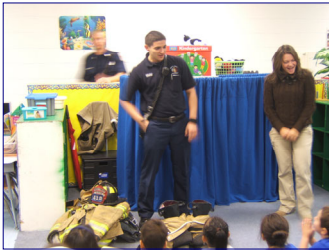
Kinder fire safety presentation

Kindergartners are enjoying "P" week – how appropriate as they decorate the pumpkins! The 1st and 2nd graders had a great time at Cox Farm picking out pumpkins, observing the farm animals, bumping along on the hayride, and just generally having fun. The 2nd graders also spent the month practicing their speeches and planning their costumes for the Parade of Saints.