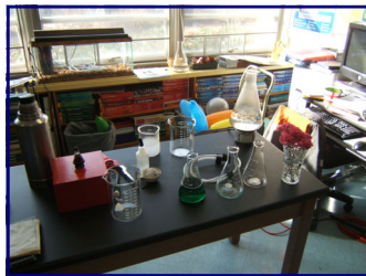
Science Day lab equipment