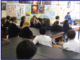
Cryogenics at Science Day