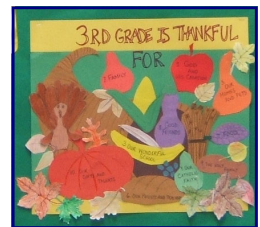
Elements of the Thanksgiving bulletin board in the hallway